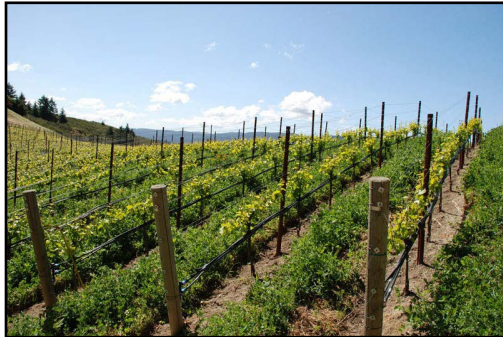
A certificate program in viticulture at Cuyamaca College and a program in craft brewing at Grossmont College are planned.

Cuyamaca College will offer new associate degree programs in Kumeyaay Studies and Arabic Studies, along with a new certificate program in mechatronics.